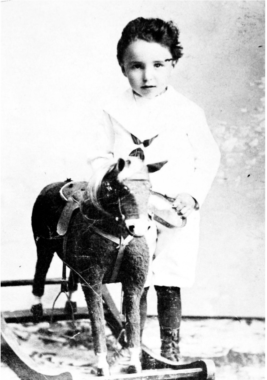
Wilhelm Reich at age three, 1900