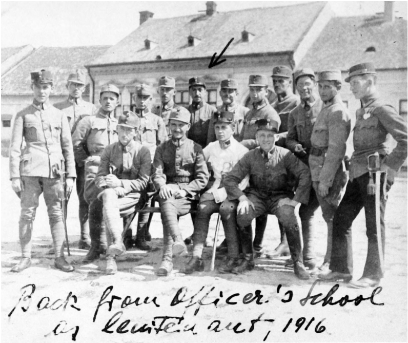
Scenes from the Great War, with Reich's own captions