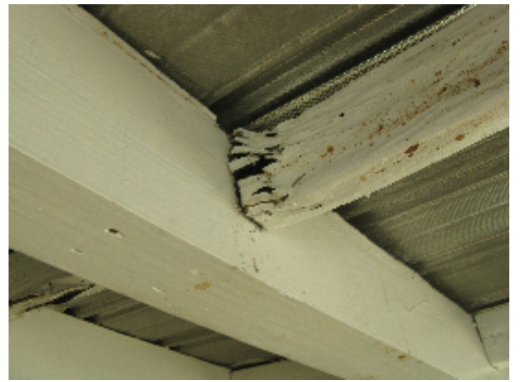
Moisture damage at covered patio