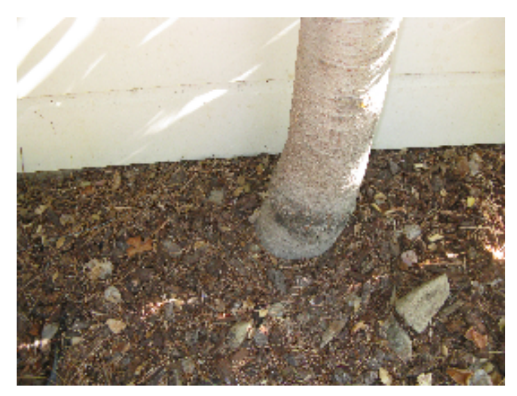
Tree too close to siding and foundation