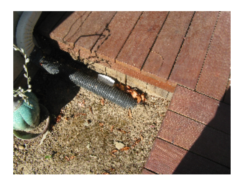
Earth/wood contact at deck